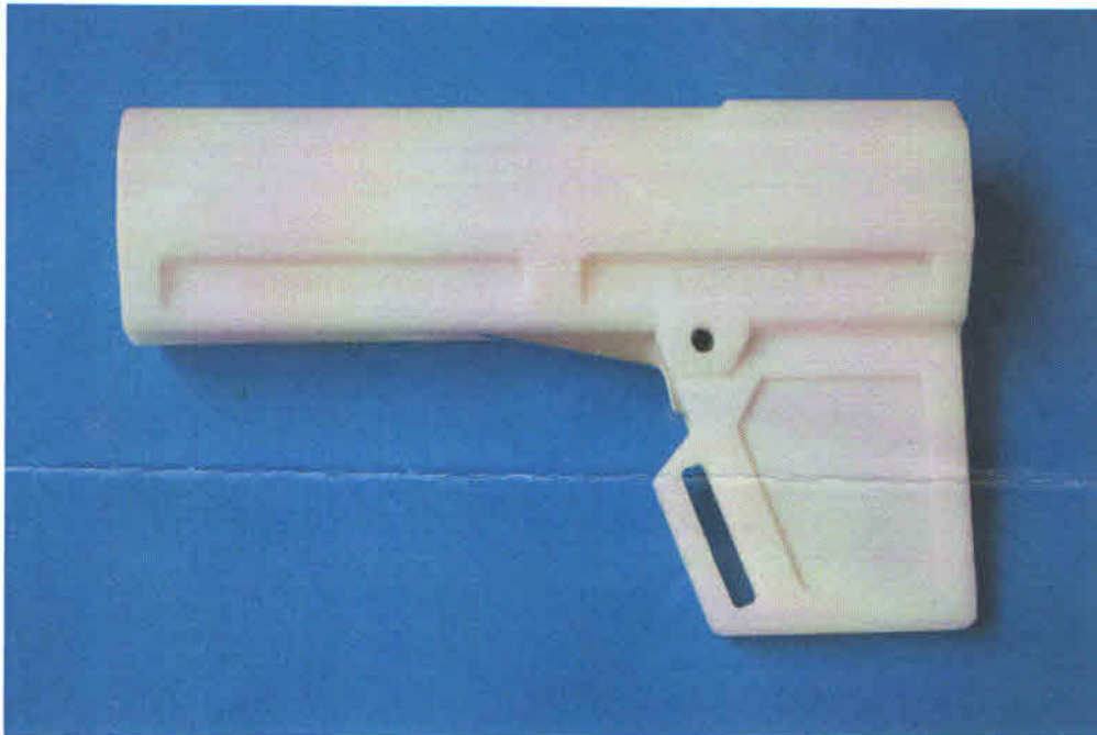
Shockwave Technologies "Blade Pistol Stabilizer 2.0" Left Side