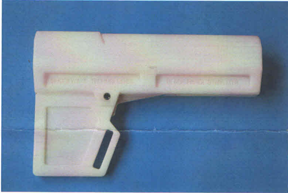
Shockwave Technologies "Blade Pistol Stabilizer 2.0" Right Side