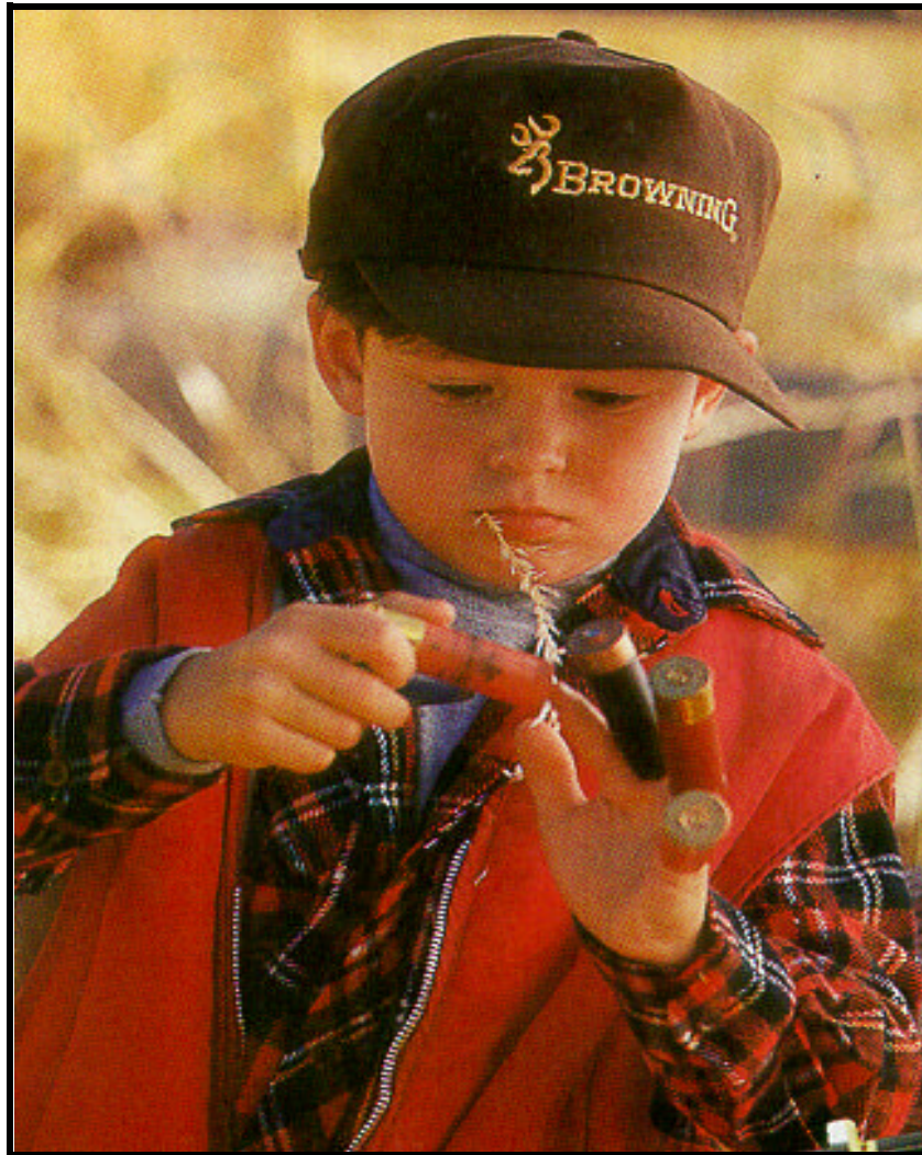
Catalog, Browning Arms Company, 1997