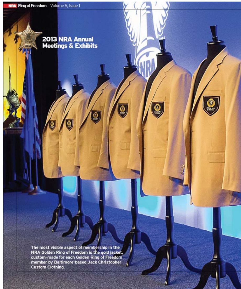
Figure 1: Custom-made sports coats await the 2013 Golden Ring of Freedom honorees