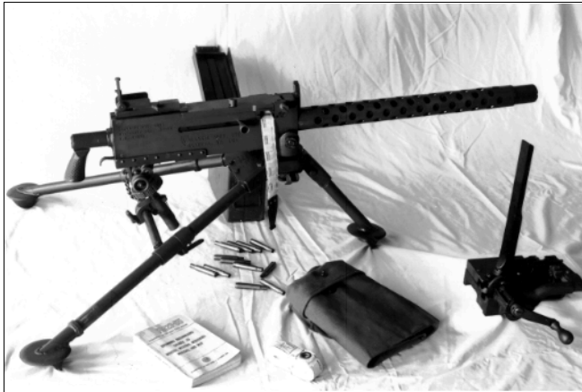
Browning 1919 A4 .30 caliber