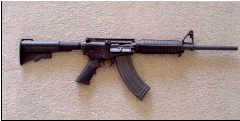
SW AR47 CAR 7.62*39 Sporting Rifle