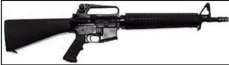
PCR-7 Eliminator 4