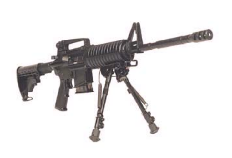
Panther 16" AP4 Post Ban w/Miculek Comp (RFA2-AP4PMC)

Phone: 1-800-578-3767 | dpms@dpmsinc.com