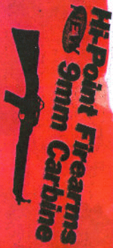
Hi-Point Firearms 9mm Carbine

FROM PANAMA TO AFGHANISTAN TO IRAQ, THE GUNS OF THE SPECIAL FORCES ARE NOW ON SALE IN AMERICA