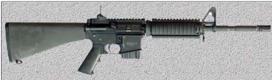
SR-15 M-4 Carbine