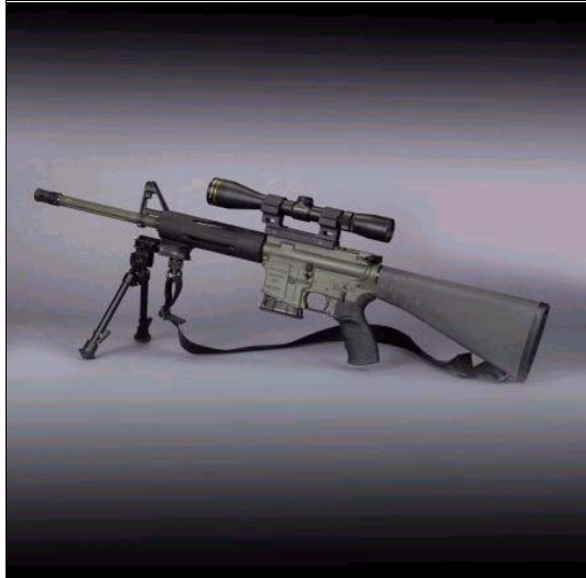
UT-15 Urban Tactical Rifle