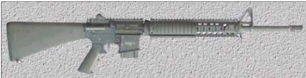
SR-15 M-5 Rifle