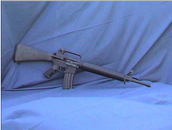
L&G AR-15 A2 20" Heavy Barrel Rifle