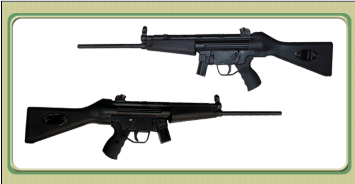
BW-5 9mm Standard Sporting Rifle

P.O. Box 21017 Mesa, AZ 85277-1017 480-832-0844 phone 206-350-5274 fax