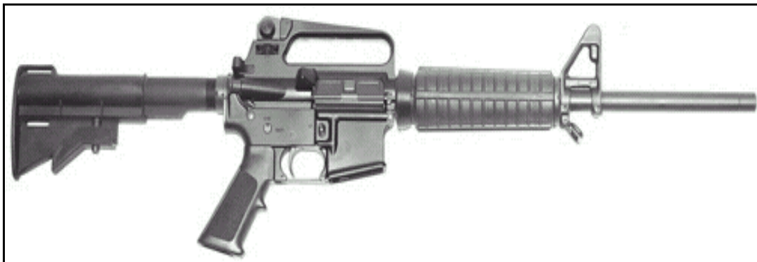
DSC STARCAR Carbine