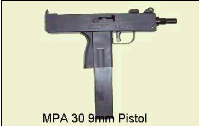
MPA 30 9mm Pistol