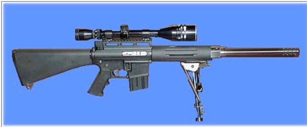
223 Tack-Hammer: FDR