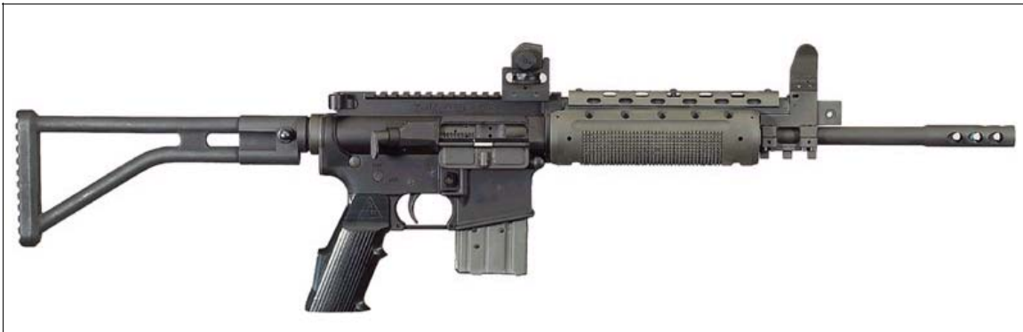
LR-300SRF Post Ban Compensated Fixstock