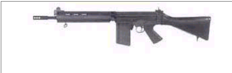
STG 58C Carbine