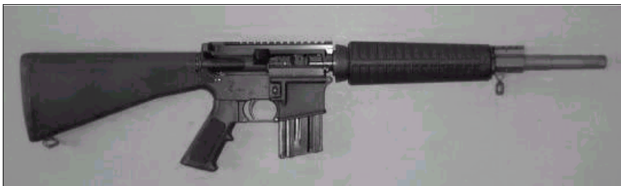
50 Beowulf Entry