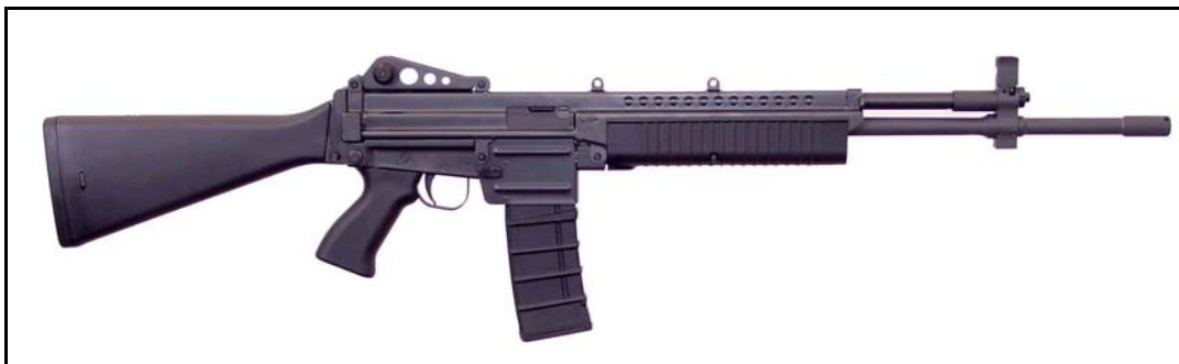
M96 Expeditionary Rifle