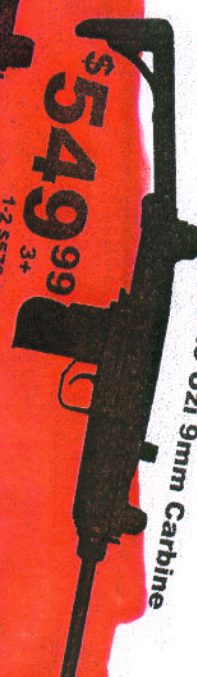
Vector Arms Semi-Auto Uzi 9mm Carbine