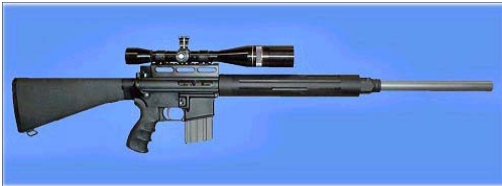
.204 Ruger Tack-Hammer