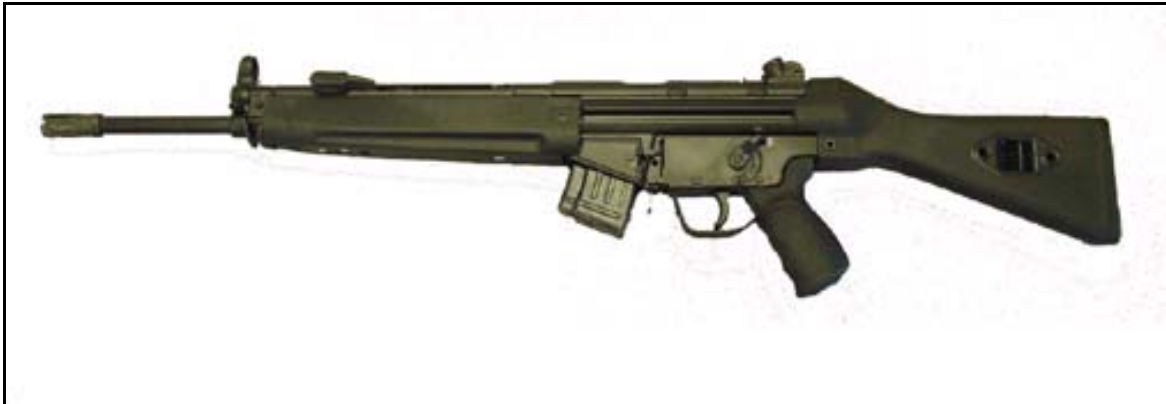
SW 32 Sporting Rifle