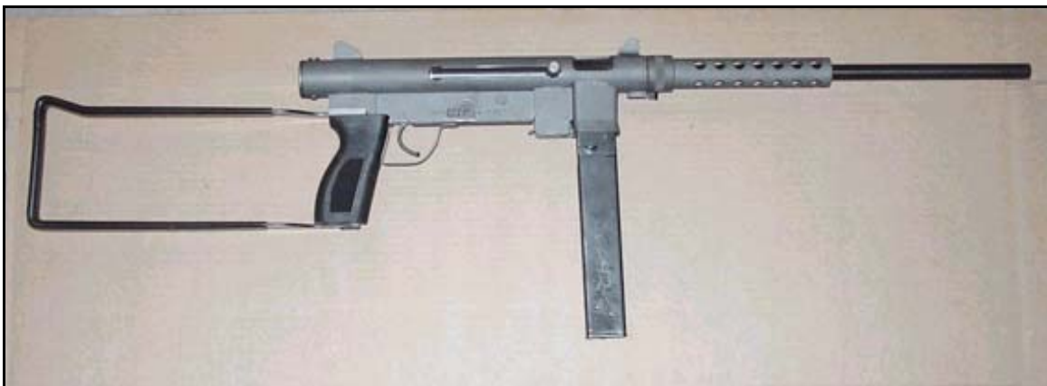
SW 760 Sporting Rifle