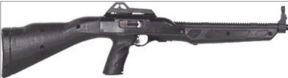
40 S&W Carbine