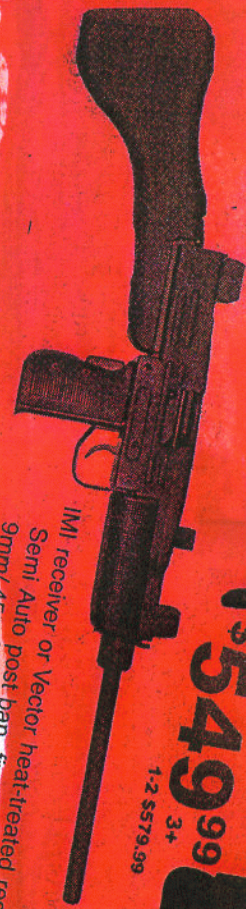
IMI receiver or Vector heat-treated receiver Semi Auto post ban, fixed stock, cal 22/ 9mm/.45 ..... $795

FROM PANAMA TO AFGHANISTAN TO IRAQ, THE GUNS OF THE SPECIAL FORCES ARE NOW ON SALE IN AMERICA