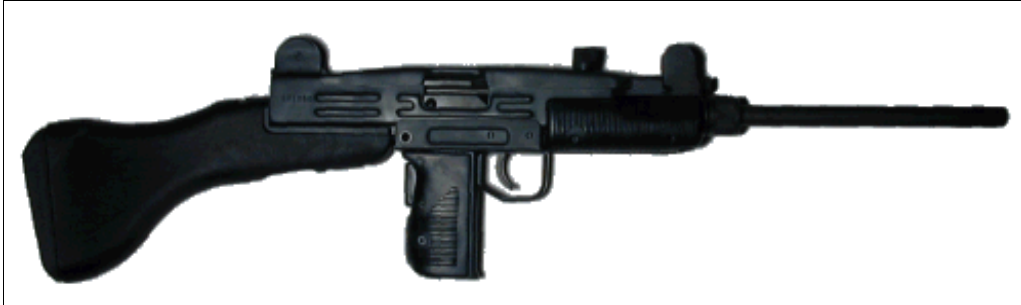
Full-Size Post-Ban UZI

270 West 500 North North Salt Lake, UT 84054 801-295-1917 phone 801-295-9316 fax