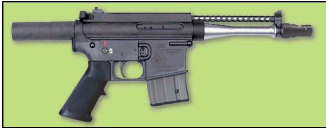
Carbon 15 Type 21 Pistol