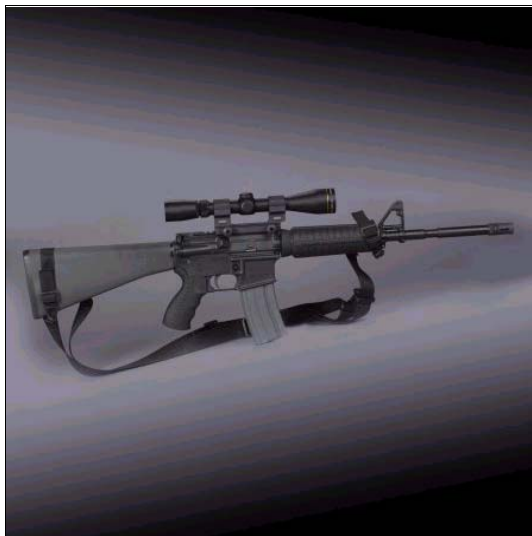
M-4T Tactical Carbine