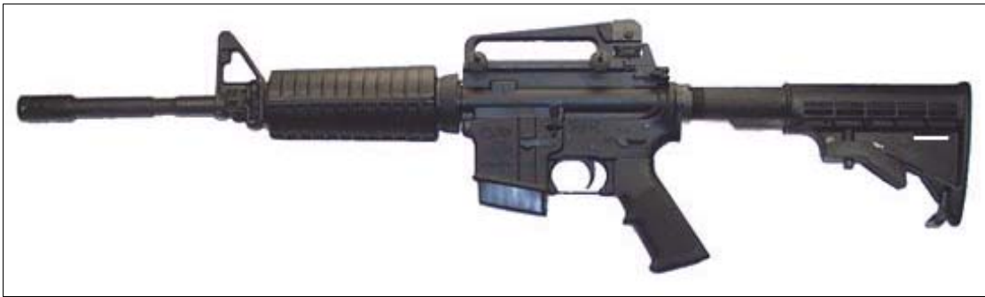
Match Target M4