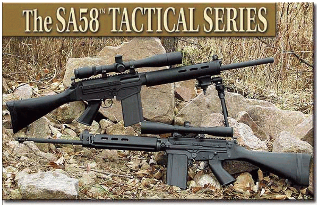
SA58 Tactical Rifle