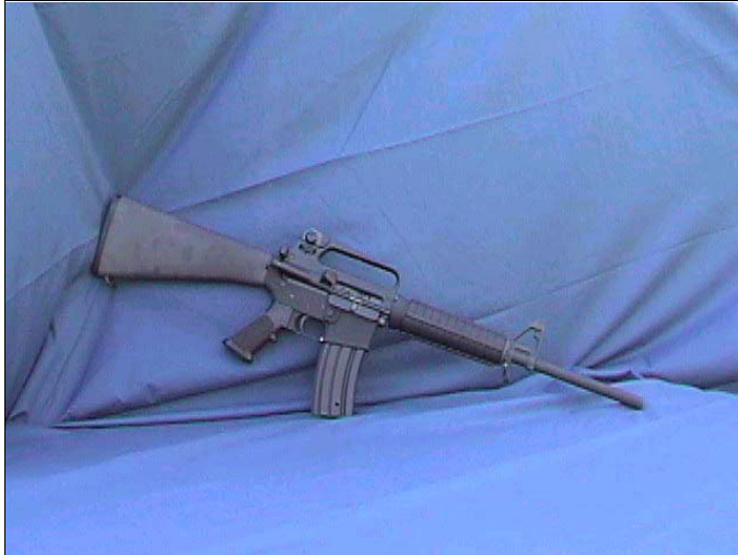
L&G AR-15 A2 16" Heavy Barrel Rifle

Huntington Beach, CA 714-840-3772 phone 714-625-4631 fax