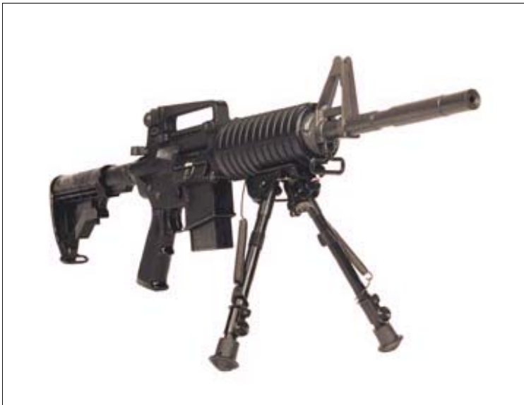
Panther AP4 Training Rifle .22LR Post Ban (RFA2-AP422P)