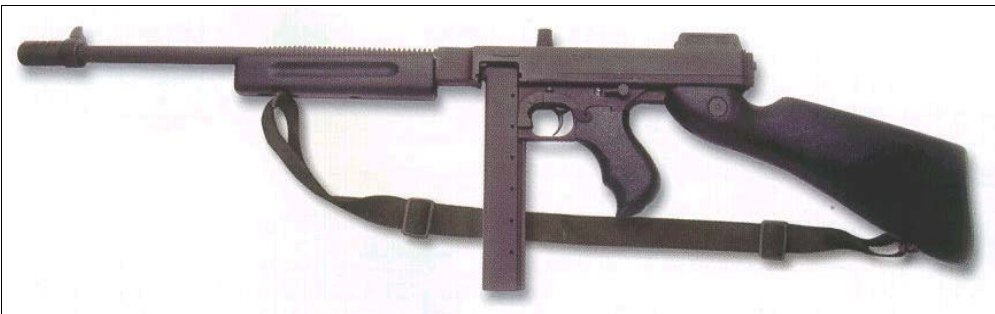
Thompson 1927A-1 "Commando"