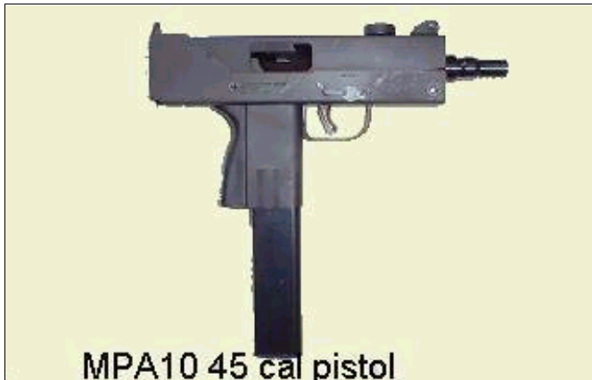
MPA10 45 cal pistol