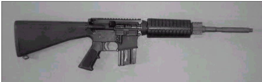
21 Genghis Entry