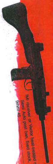
IMI receiver or Vector heat-treated receiver Semi Auto post ban, fixed stock, cal 22/ 9mm/.45

THE WORLD'S FINEST BRITILE RIFLES NOW AVAILABLE IN CIVILIAN LEGAL SEMI AUTO!