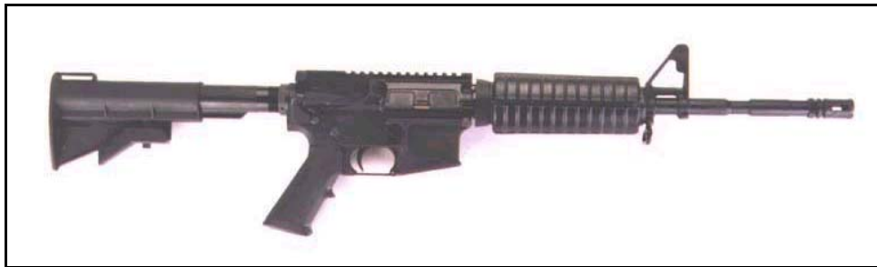
ASA 16" M4 Rifle .223 cal