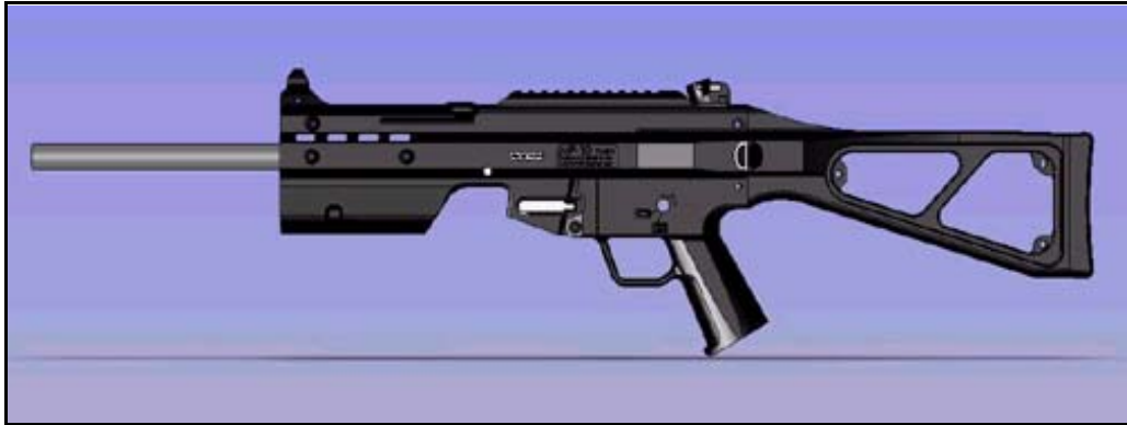
SP10 9mm Sporting Rifle

4613 E. Ivy Street Suite 102 Mesa, AZ 85205 480-830-5652 phone 928-396-1538 fax