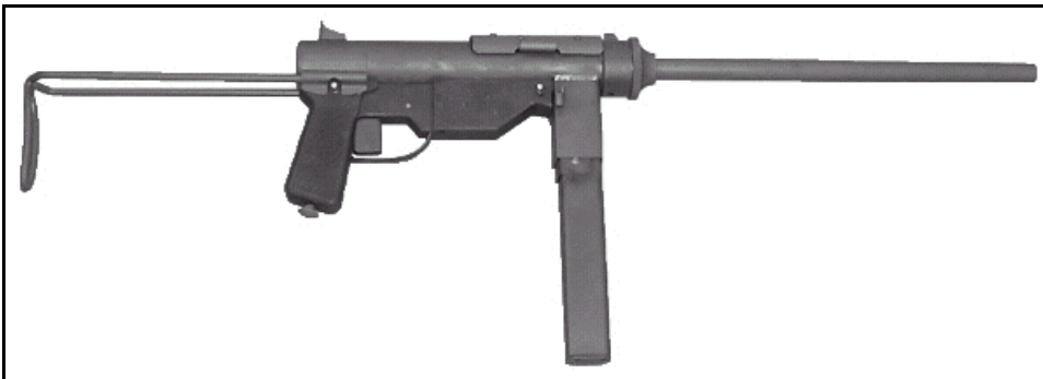
US M3-A1 Grease Gun