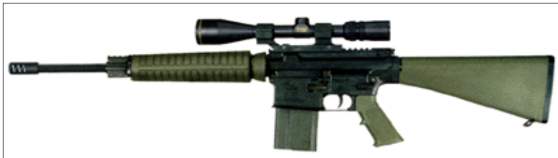
AR 10-A4 Carbine