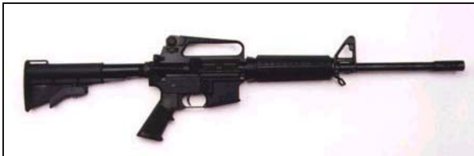
ASA C.A.R. 16" Rifle .223 cal