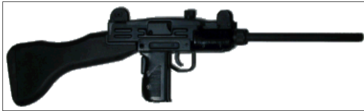
Mini Post-Ban UZI