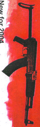
New for 2004

YOUR SOURCE FOR ALL UZI, AK, HK .223, AND RPD FIREARMS, ACCESSORIES AND SERVICE