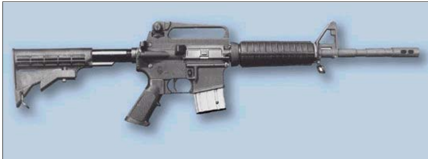
XM15 E2S M4 Type Post-Ban Carbine