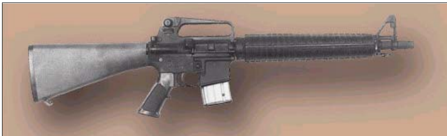
XM15 E2S Dissipator Carbine