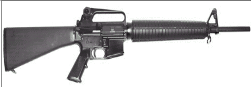
DSC STAR-15 Rifle