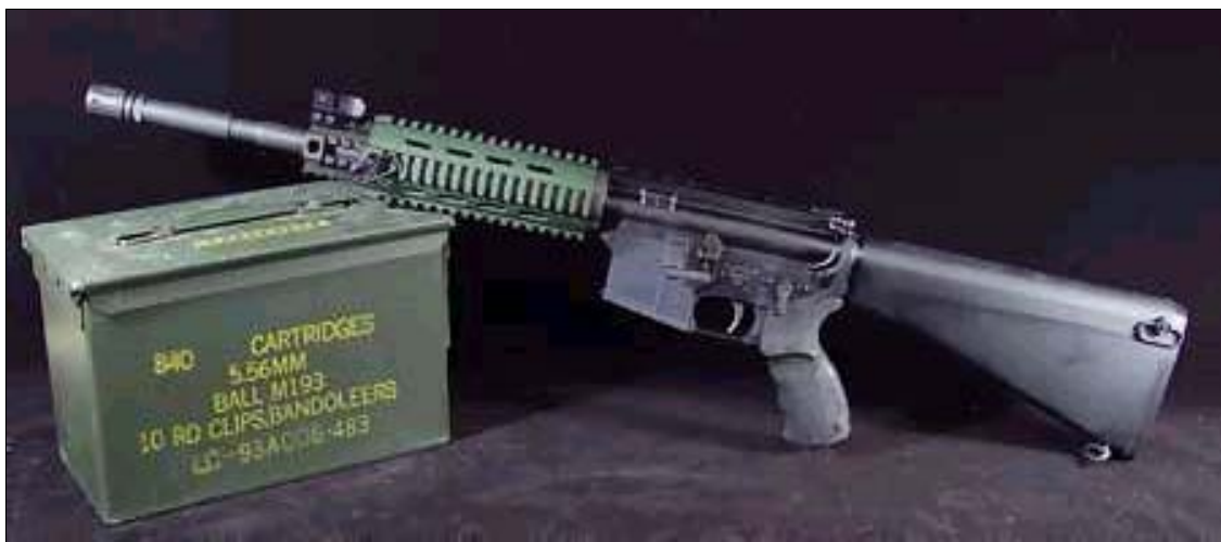
Liberator FAR-15 Rifle (aka "Guardian II")