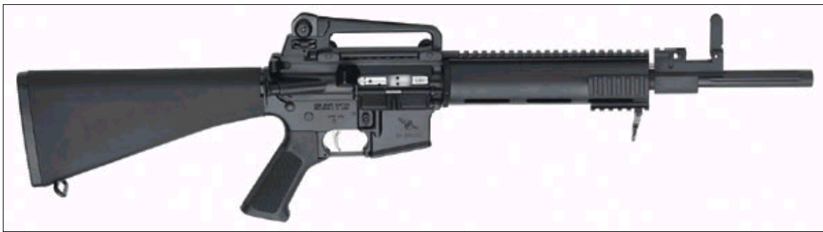
Les Baer Custom Thunder Ranch Rifle